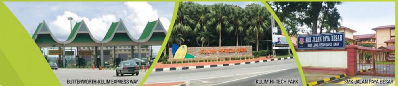
BUTTERWORTH-KULIM EXPRESS WAY